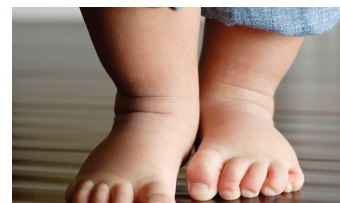
$500 To install the floors for little feet to run freely upon.