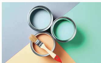
$50 For paint to brighten a room.

Become a Monthly Donor! We have a special group of supporters who believe so deeply in our work that they are Monthly Donors—also known as Habitat HopeBuilders. By becoming a HopeBuilder , you are helping local families build strength and stability.