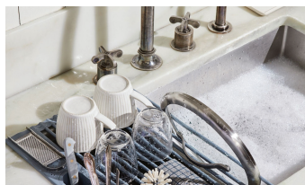
$100 For a kitchen sink to let dishes soak in after a healthy family meal.